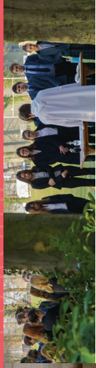
Shepherds at Christmas Alive! Fountain of Life, Ashill