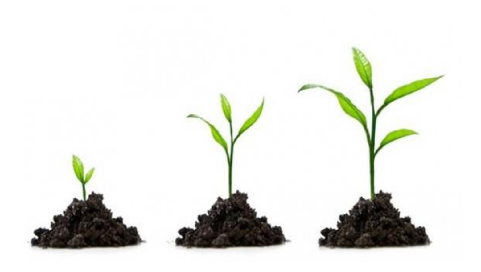
Working Together Growing Faith